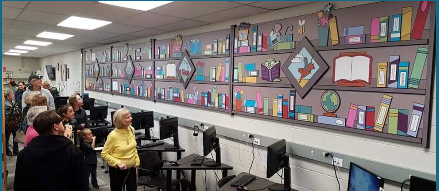
Strathmore Municipal Library Book Case Donor Wall

Located above the computer section of the Strathmore Municipal Library building, the donor wall bears the names of our generous donors. This colourful display allows businesses, families, community groups, and individuals to show their support for the Strathmore Municipal Library.